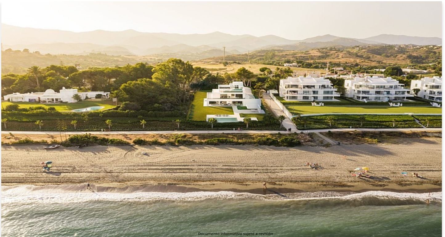
Documento informativo sujeto a revisión