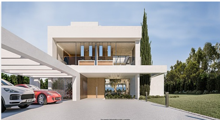
Documento informativo sujeto a revisión